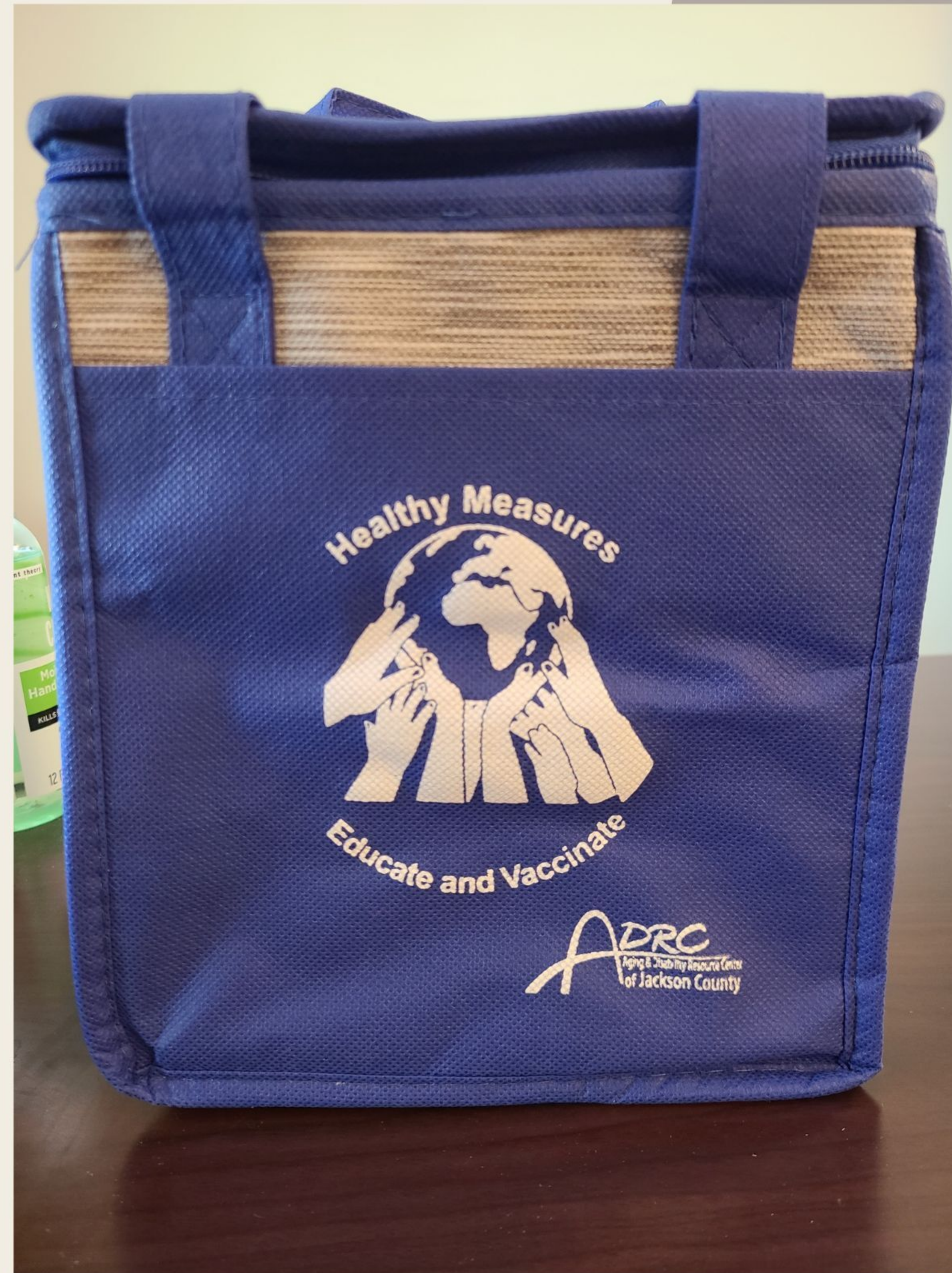
Insulated Tote which can be used later for grocery shopping or other short trips